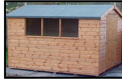
Standard Garden Shed